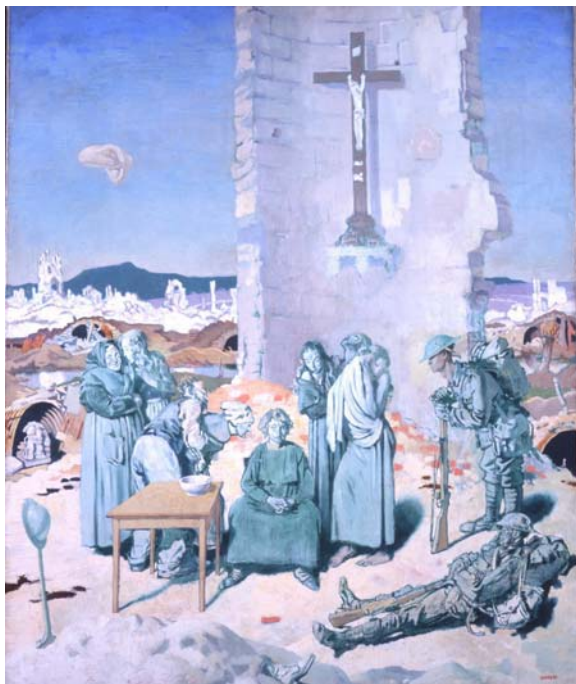
Plate n° 1

Sir William Orpen (1878-1931) The Mad Woman of Douai, 1918 Oil on canvas. 762mm x 914mm